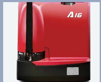
Designed to be narrow with large round corners to improve suitability for concentrated shelves and with a wedge-shape chassis to provide higher passing ability