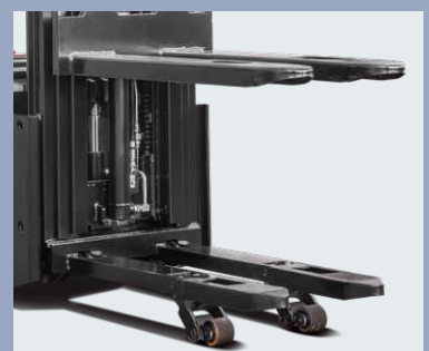
With the upper and lower pallet handling design to meet the stacking operation need and enable a higher efficiency of goods handling